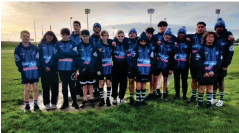
Central Rugby Club U13 Global Games 2022

Don't hesitate to get in touch with our awesome team here at Moana Clothing, we'd love to hear from you and you'll see that Pride Shows in all our work.