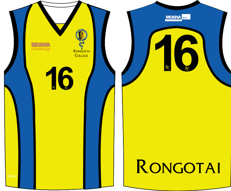
Rongotai College Volleyball