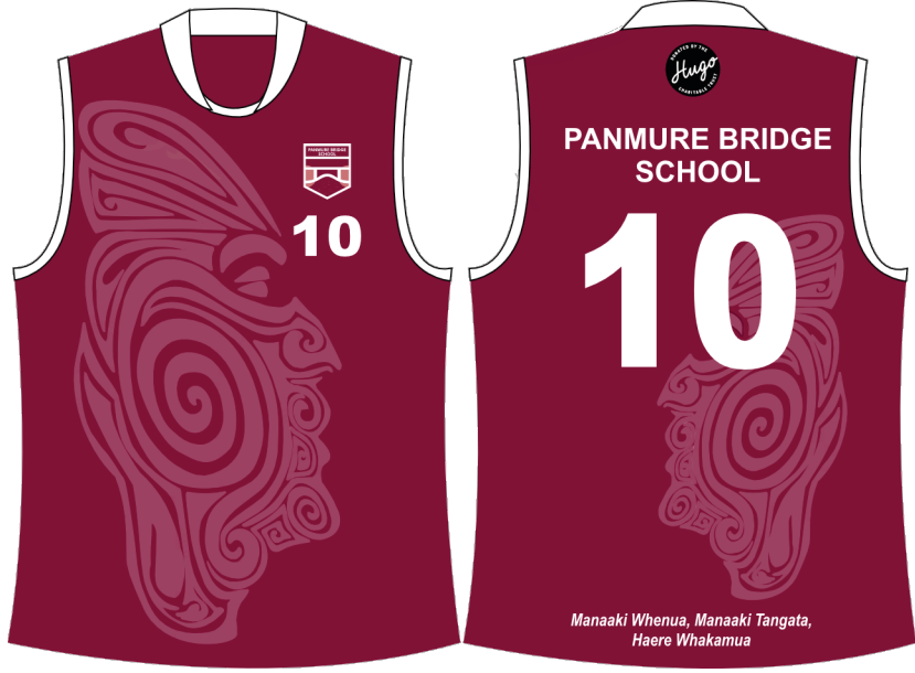
Panmure Bridge Touch