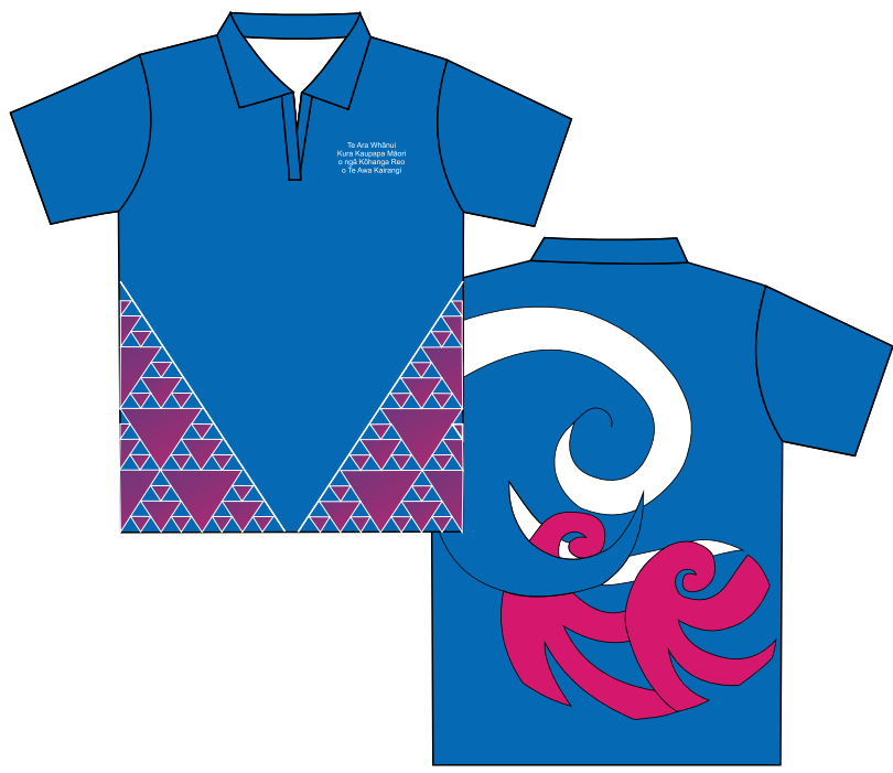
Te Ara Whanui Uniform Jr Polo