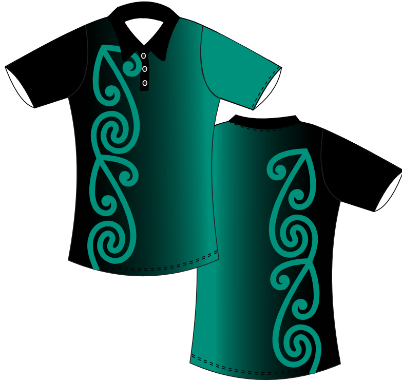
Te Puni Kokiri Kapa Haka