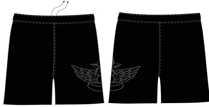
Hutt Valley High Football Shorts