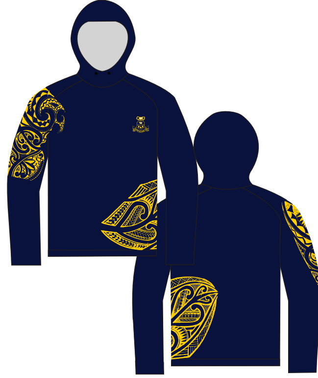
Panmure Bridge Staff Jacket