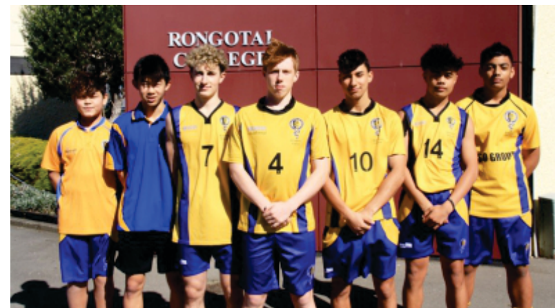
Rongotai College Sportswear