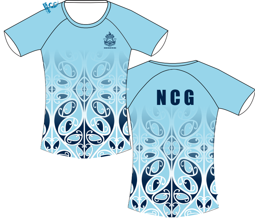
Nelson College For Girls PE Top