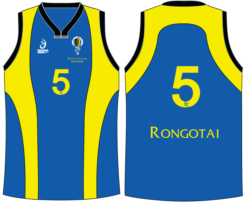
Rongotai College Senior Basketball Reverse Colour