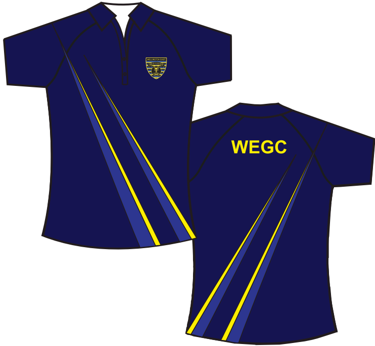
Wellington East Girls College PE