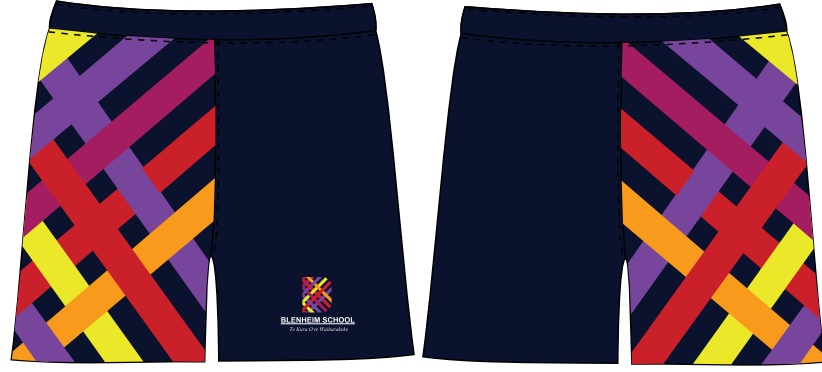
Blenheim School Shorts