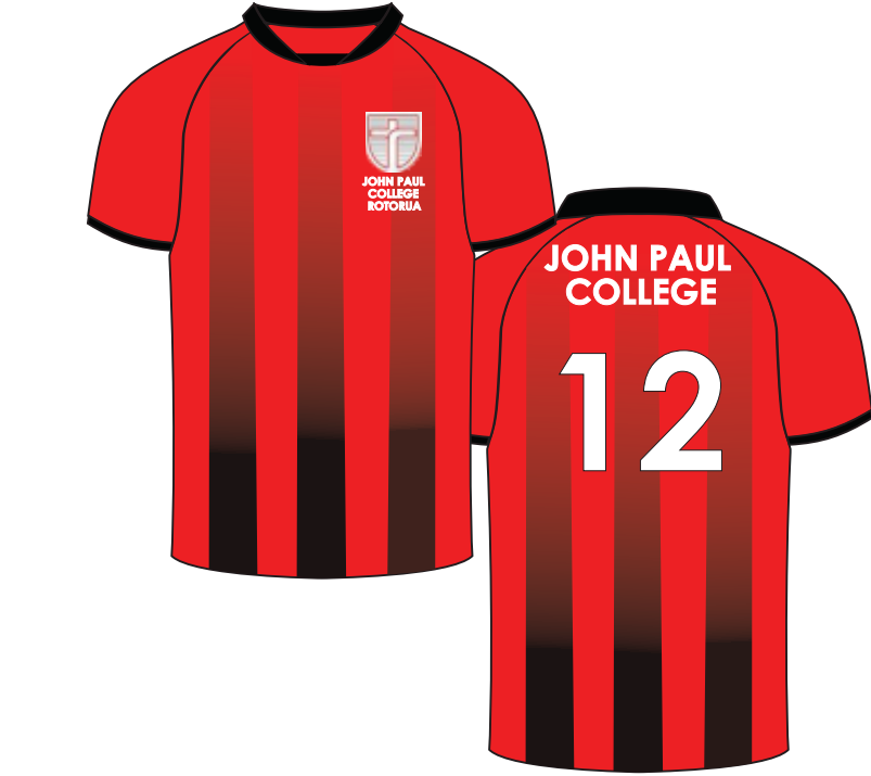
John Paul College Football