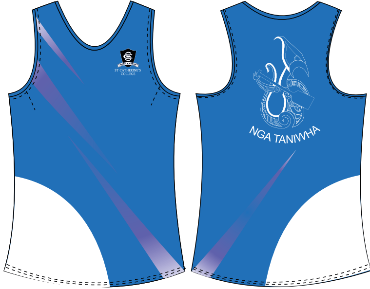
St Catherine's College Dragon Boating