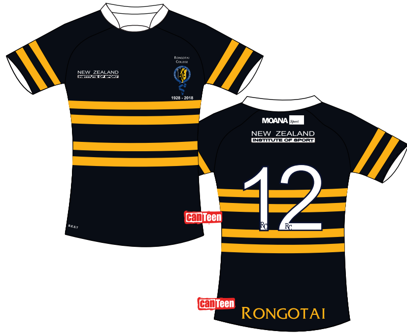
Rongotai College First XV Rugby 90th Anniversary