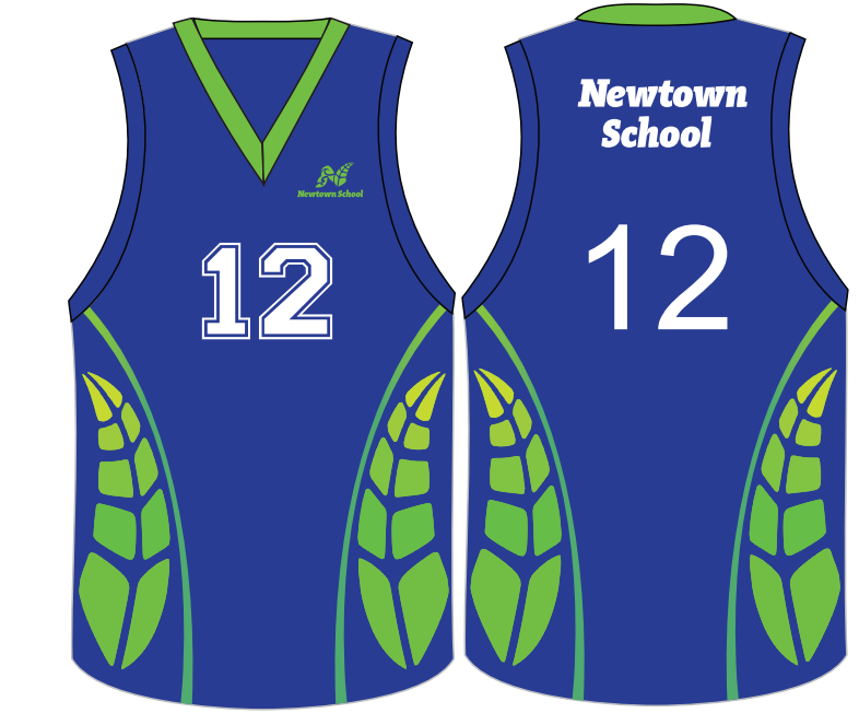
Newtown School Basketball