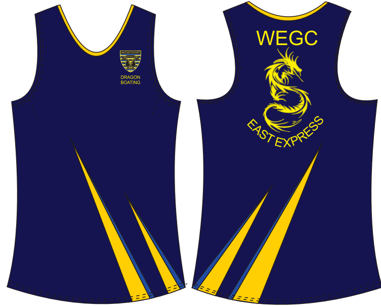
Wellington East Girls College Dragon Boating