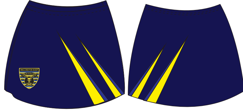
Wellington East Girls Hockey