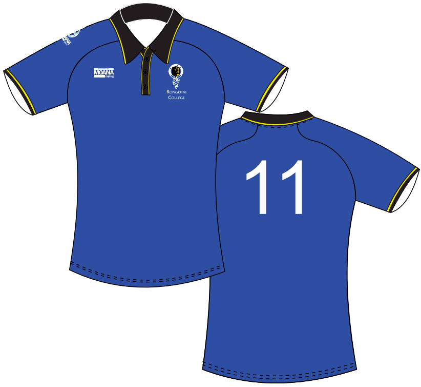
Rongotai College Hockey Alternate Polo