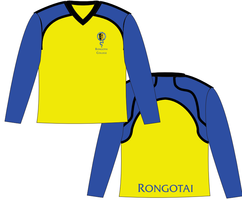
Rongotai College 1st XV Cricket Jersey