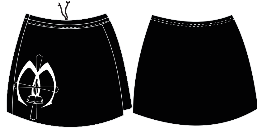
St Marys Blenheim Netball