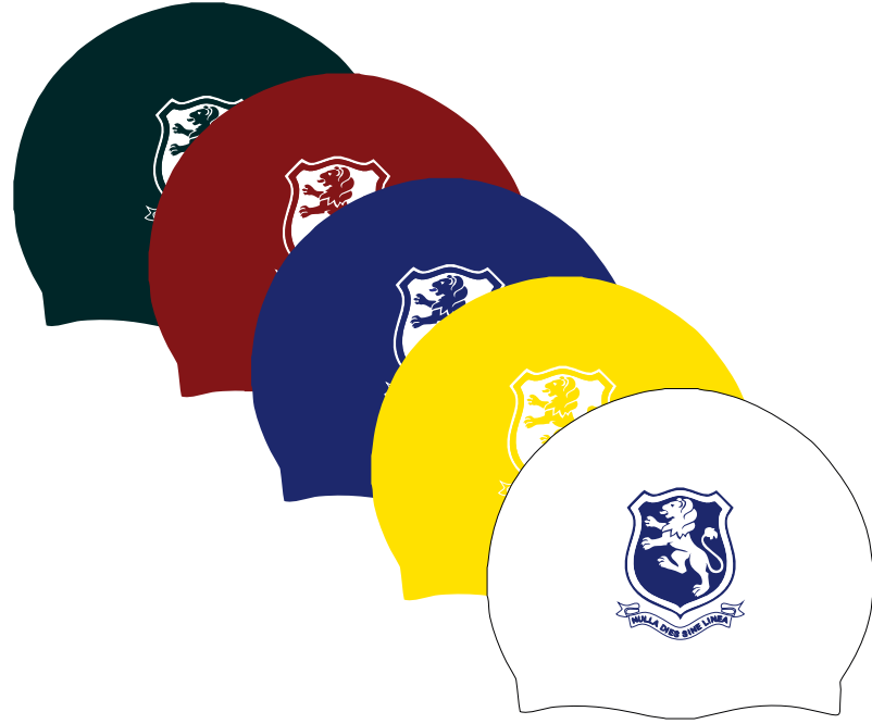
St Marks Swim Caps