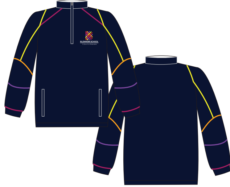
Blenheim School Fleece